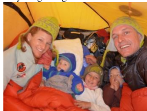
Our home on 5400 m