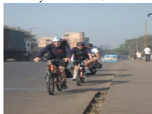
from Kolkata 6'000 km to the Pandas