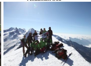
TOPtoTOP Award Expedition 2010