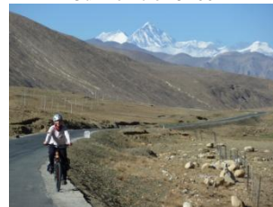
Everest in the back