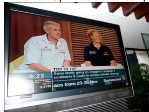
Great Media Coverage