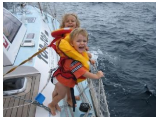
Always attached with nature