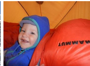
smily in thin air