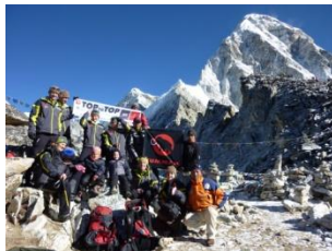
Kala Patthar 5700 m