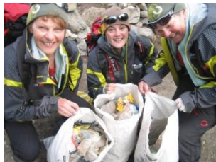
Clean-Up the Himalayas