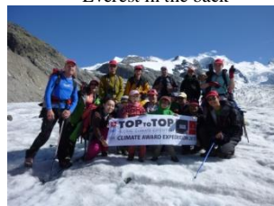
10 years TOPtoTOP