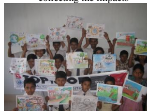
Drawing contest West Bengal