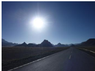
cycling trough Tibet and China