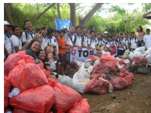
Clean-Up in Bali