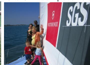
thanks to Victorinox and SGS