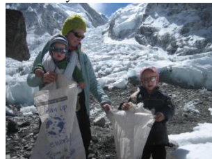
Clean-Up Everest Base Camp