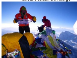
TOPtoTOP on Everest