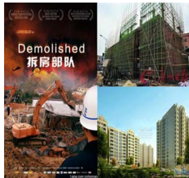
In China, uncountable residential houses are knocked down and rebuilt for GDP; the average life span of the building is only 30