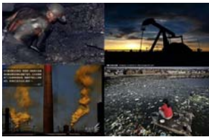
Resource exploitation Pollutant discharge

Uncontrolled exploitation and plundering of natural resource, irresponsible and indiscriminate discharge of pollutants have contributed to climate change, which brings about the disappearance of many island countries and other adverse effects (the following pictures).