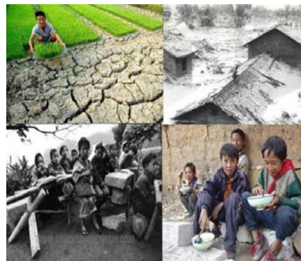
Lots of death and loss are contributed by frequent drought and flood, making poor districts poorer, no enough food and no education