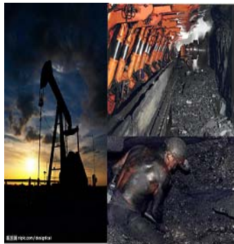
Uncontrolled exploitation of resources (coal, oil) for economic development

Nobody could fail to remember clearly the world famous Copenhagen Conference, which meant to solve the problems of climate changes and to avoid the disasters brought by climate changes via cooperation between different countries. Nobody could fail to recognize that the climate is becoming stranger and stranger, not the same as before from personal experiences—more Natural Disasters, unpredictable changing temperatures, deterioration of ecological environment. Definitely, The earth is suffering thousands of sore bruise because of human activity—uncontrolled exploitation and plundering of natural resources. It is universally acknowledged that driven by economic benefits, people of environmental consciousness making short-term benefits at the expense of sacrificing the environment have worsened the ecological environment and changed the climate.