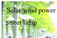
Solar/wind power street lamp