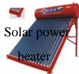
Solar power heater